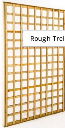
Rough Trellis 100Sq

Above are pressure treated but not sealed