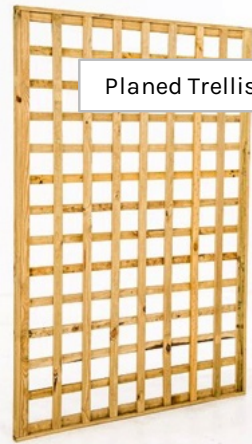
Planed Trellis 100Sq