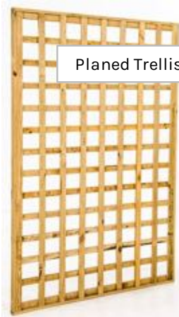
Planed Trellis 100Sq