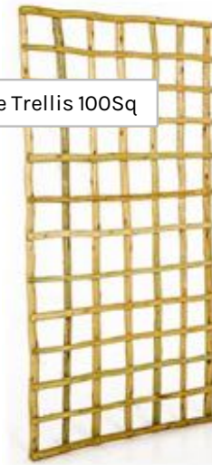
Latte Trellis 100Sq