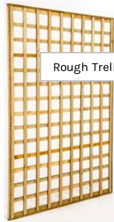
Rough Trellis 100Sq

Above are pressure treated but not sealed